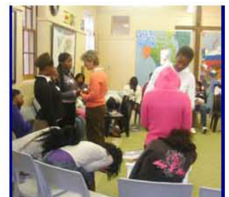
LSFM Girls' retreat in YWAMuizenberg