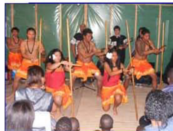
Island Breeze performing in LSFM Delft